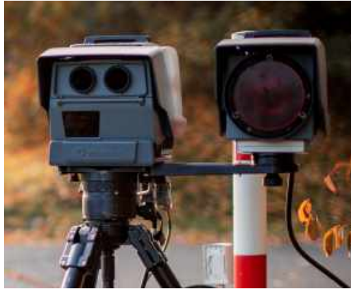
Speed Watch Analysis May 2022